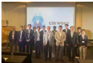
International Exchange Program for CIB W062 Symposium