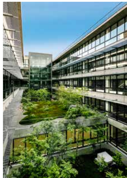
Kyoto City Hall Branch Office