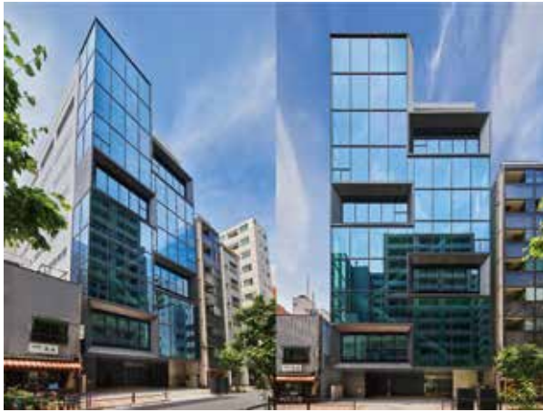
Shinryo Shinjo Building