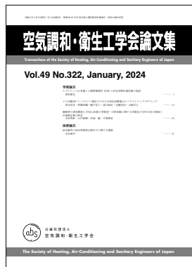
SHASE Transaction Peer-reviewed