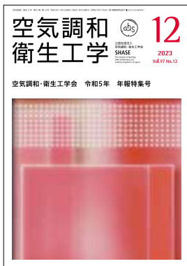
SHASE Monthly Journal