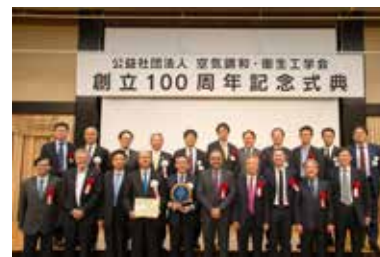
With agreement organizations on December 1, 2017