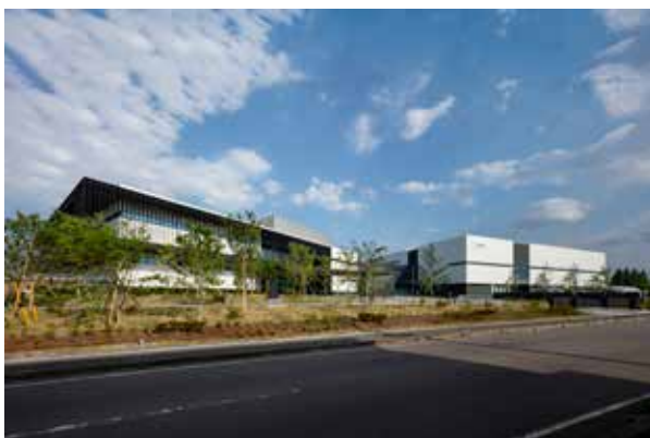
Takasago Thermal Engineering Innovation Center