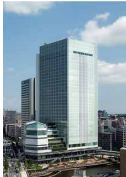
Yokohama City Hall